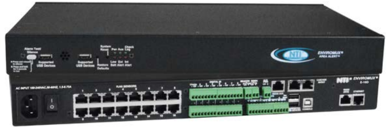
E-16D (Front & Back)