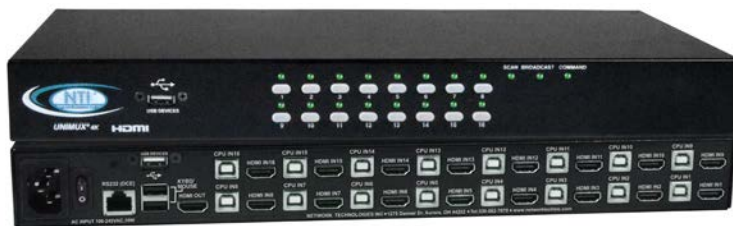
UNIMUX-HD4K18GB-16 (Front & Back)