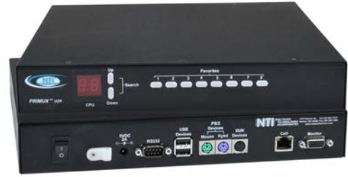
PRIMUM-UZR (Front & Back)