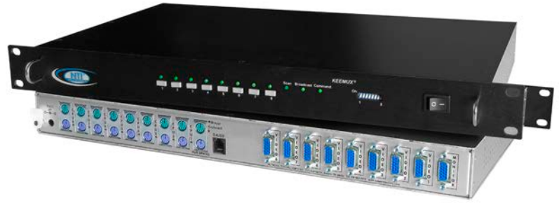
KEEMUX-P8-R (Front & Back)

The KEEMUX® PS/2 KVM switch allows one keyboard, monitor and mouse to control multiple PCs (up to 128 computers). Dedicated internal microprocessors emulate keyboard and mouse presence to each attached PC 100% of the time so all computers boot error free.