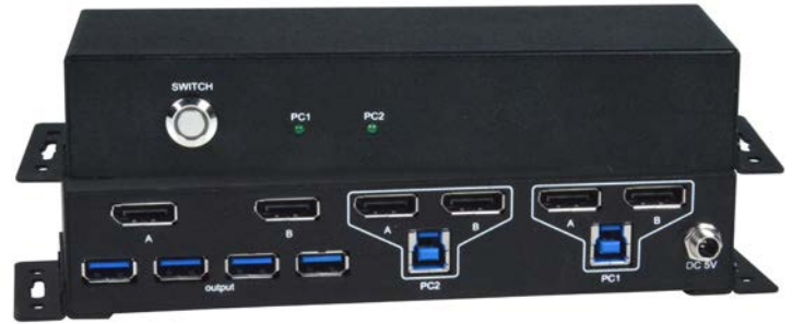
UNIMUX-DP4K-2DH (Front & Back)