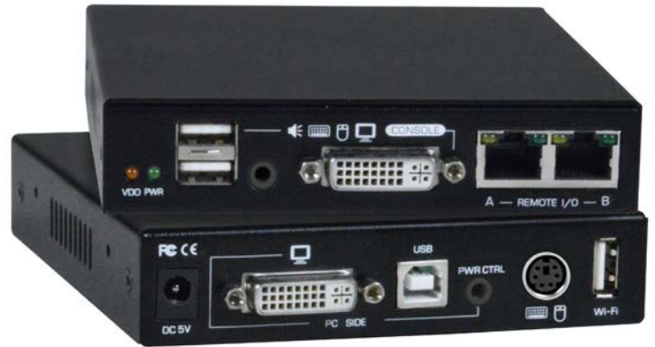
INTERMUX-KVMDUPIP (Front & Back)

The INTERMUX™ DVI USB KVM on IP™ device is used to control one or many computers locally at the server site or remotely via the Internet using a standard browser. Securely gain BIOS level access to systems for maintenance, support, or failure recovery over the Internet. Communication is secure and can be used in conjunction with a KVM switch for multiple-server access.