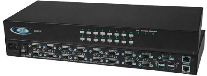
UNIMUX-USBV-16HDUT (Front & Back)