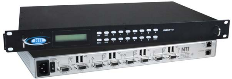
UNIMUX-4X8-UHD (Front and Back)

The UNIMUX™ High Density VGA USB KVM Matrix Switch allows up to four users to individually command or simultaneously share up to 32 USB computers. Access USB computers (PC, SUN, and MAC) using USB keyboards and mice, and VGA multiscan monitors.